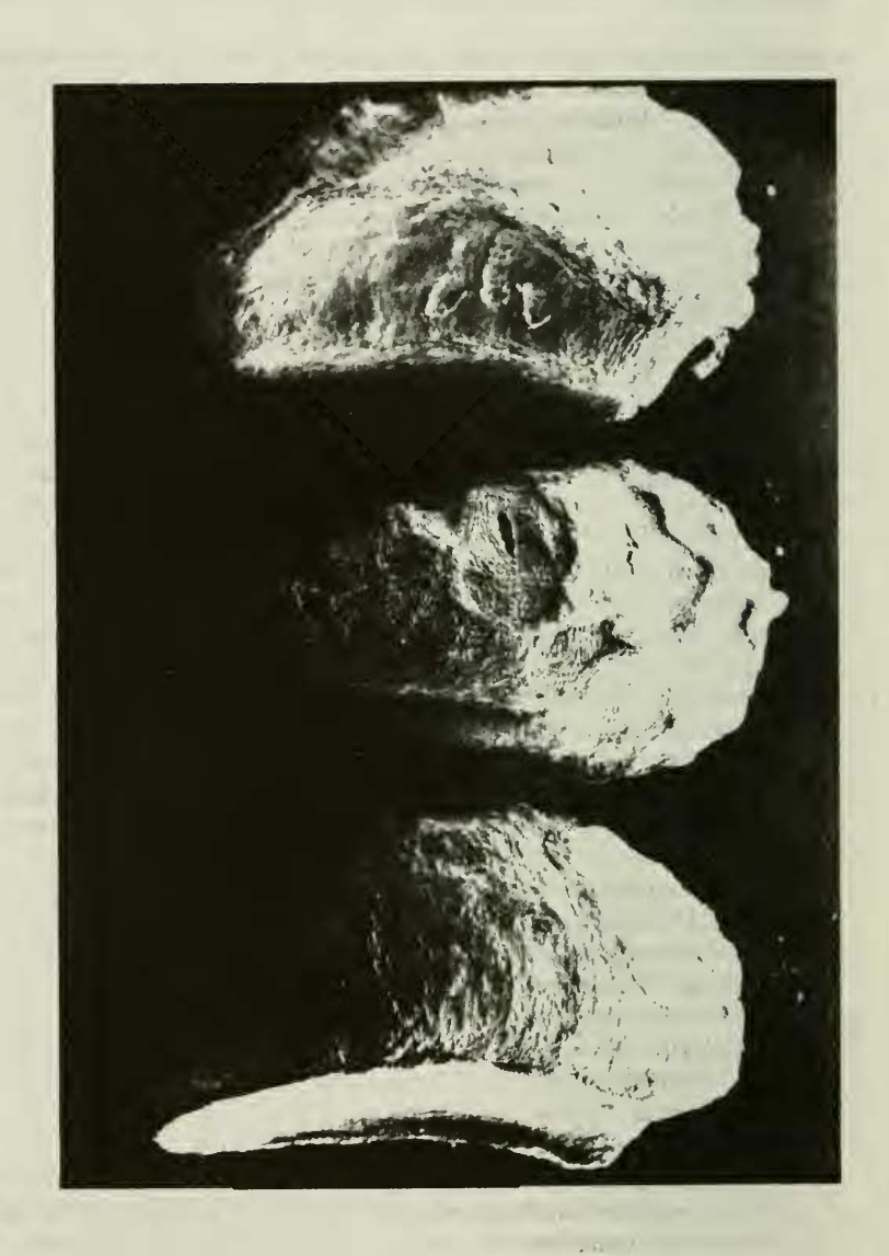
Figure 3. Achenes of Thelesperma graminiformis, Stanford, Lauber, & Taylor 2510 (MICH).